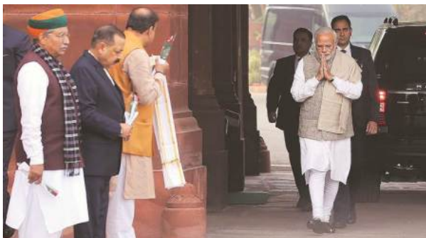
MCI era is over: New regulator for medical education, exit tests for MBBS